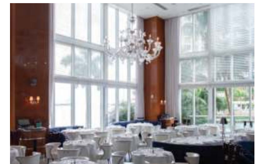
Right Page: Pérez Art Museum, Brickell Shopping, Cipriani Downtown Miami